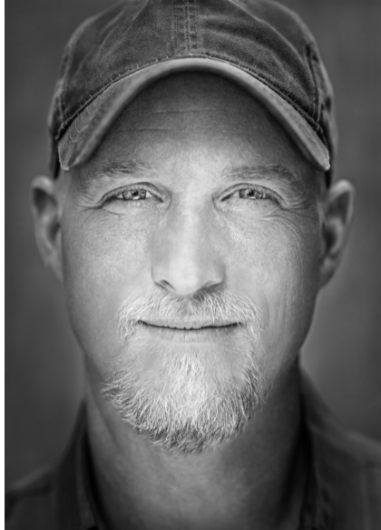
Paul Nicklen