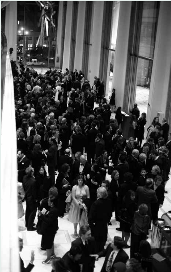
2008 Lucie Awards at Avery Fisher Hall, Lincoln Center, NYC

OUR MISSION IS TO HONOR MASTER PHOTOGRAPHERS, DISCOVER AND CULTIVATE EMERGING PHOTOGRAPHERS, AND PROMOTE THE APPRECIATION OF PHOTOGRAPHY WORLDWIDE.