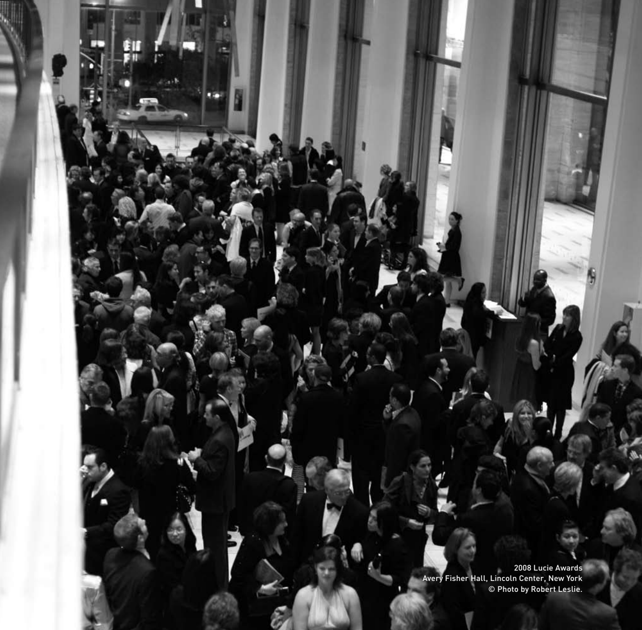
2008 Lucie Awards Avery Fisher Hall, Lincoln Center, New York