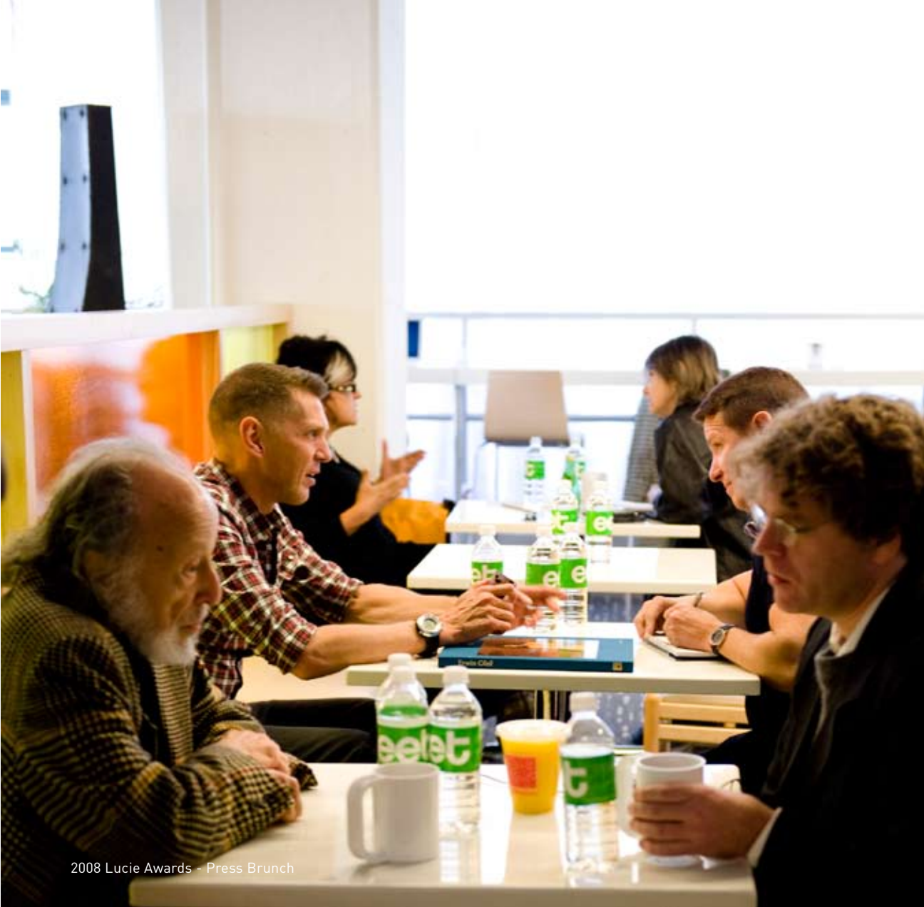
2008 Lucie Awards - Press Brunch